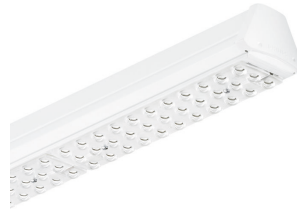
Maxos Led Industry - Generation 4 - 1 unit for TL5 49 W - LED Module, system flux 6600 lm - 840 neutral white - Power supply unit with DALI interface and constant light output - Wide beam - Constant light output - Connection unit 5-pole - White