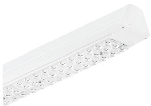
Maxos LED Industry 4MX850 electrical unit