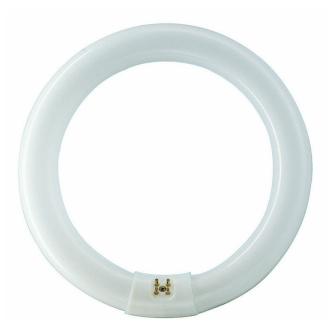
LPPR TL-E8 G10q