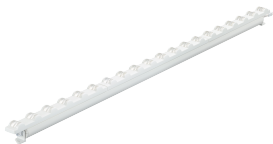
PureStyle RGBA – 30° x 60° – Střední paprsek – 1200 mm