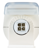
PureGlow IntelliHue Powercore LED fixture end connector