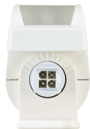
PureStyle IntelliHue Powercore LED fixture end connector