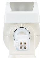
PureStyle IntelliHue Powercore LED fixture end connector