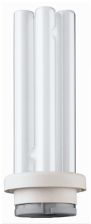
14W, GR14q-1, 4P