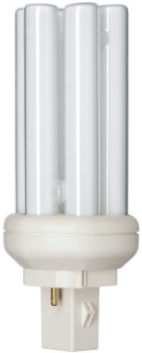
18W, GX24d-2, 2P