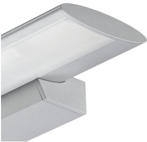
Derungs CWS490 room light