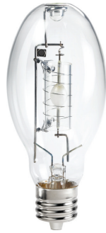
EX39, ED-28, Clear