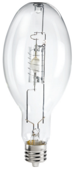
EX39, ED-37, Clear