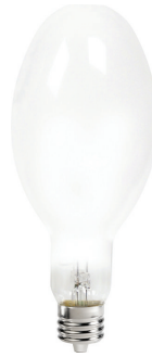
EX39, ED-37, Coated