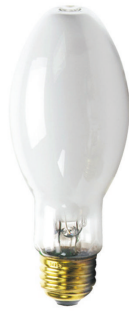
BD17 Medium Coated