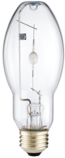
ED17 Clear Medium Elite