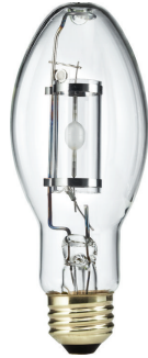
E26, ED-17P, CL, Elite, 50W /940