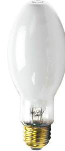
E26 ED17, ED-17P Coated