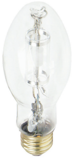
E26, ED-17P, CL, Alto & Fadeblock