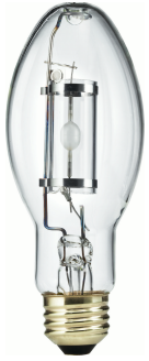
LPPR D-MHC-P 0015