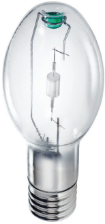
100W, E39/EX39, ED-23 1/2, Clear