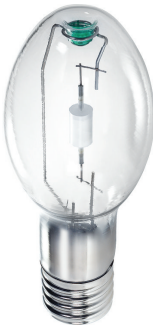
150W, E39/EX39, ED-23 1/2, Clear