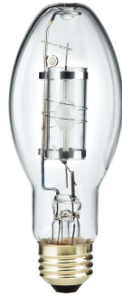
E26, ED-17P, CL, Elite,70-100W /940