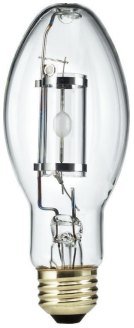
E26, ED-17P, CL, Elite, 50W /940