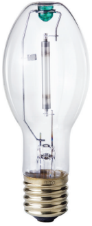
E39, ED-23 1/2, Clear