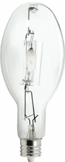
400 W Exclusionary Mogul Screw ED-37 Clear CCT of 3500K