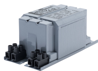
BSN 70/50 K302-A2-TS 230V 50Hz