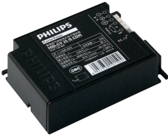
HID-CV 35 /S CDM 220-240V