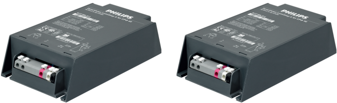
HID-DV Xt LS-6, LS-8 60 CPO Q