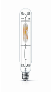
HPI-T 1000W E40