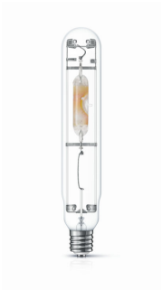
HPI-T 1000W E40