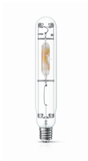
HPI-T, 1000W, E40