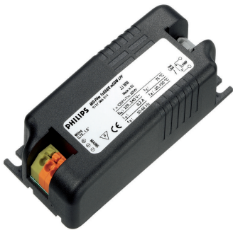
HID-PV m PGJ5 35 /S CDM 220-240V 50/60Hz