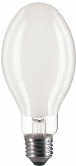
LPPR SON E27 E26