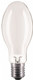
LPPR SON E40 E39