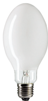
SON H, E27