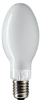
SON H, E40