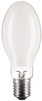
MASTER SON PIA Plus E40