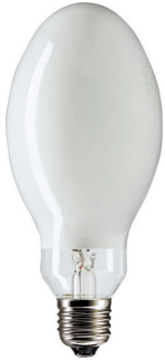
MASTER SON PIA E27