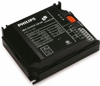
EB-C 113 PL-T/C 220-240V 50/60Hz