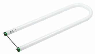
Medium Bi-Pin Fluorescent U-bent T 8/8 inch with 6" spacing