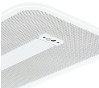
SmartBalance_Suspended_Space Wise-SP480P_SP482P_SWZ- DP02