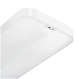
SmartBalance FFS DPP