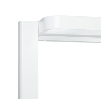
SmartBalance FFS DPP