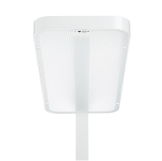
SmartBalance FFS DPP