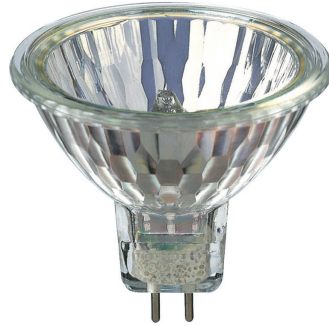
GU5.3, MR16, Closed