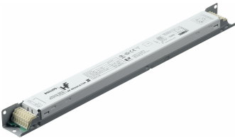
HF-R 149 TL5 EII 220-240V 50/60Hz