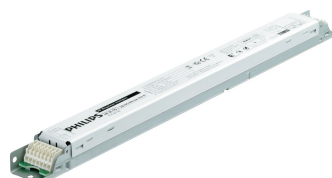
HF-Ri TD 1 28/35/49/54 TL5 E+ 195-240V