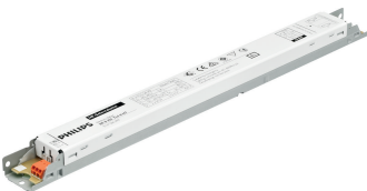
HF-S 154 TL5 II HT 220-240V 50/60Hz