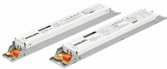
HF-S 118, 136 & 158 TL-D II, HF-S 3/414, 3/424 TL5 II