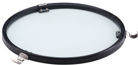
VerseBay accessories ZPK518