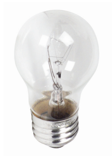
Single Contact Medium Screw A 15mm Clear