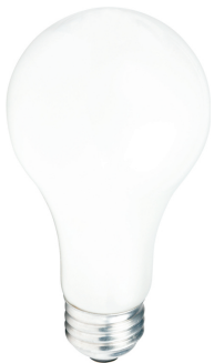
E26, A23, Frosted