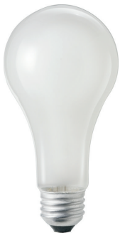
E26, A21, Frosted