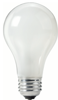
Single Contact Medium Screw A 19mm Frosted