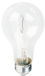
E26, A21, Clear