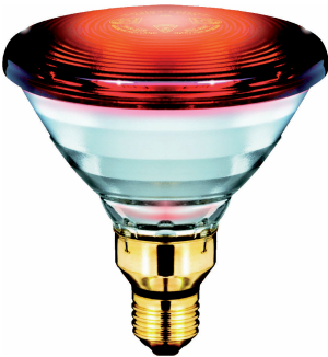
LPPR IRINPHI E27 PAR38