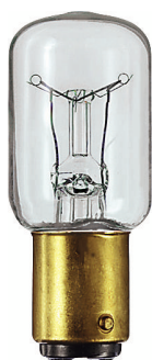
LPPR ITUBAPE 0001