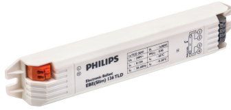
EBE 136 TLD 240 OEM