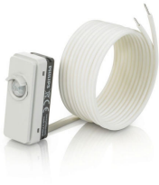
LRM8119/00 Lum Based Ext Sensor with LCA8004/00 COVER