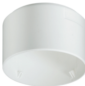
LRH2070/00 SURFACE BOX