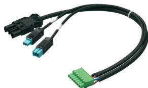
LCC2070/00 CABLE BASIC