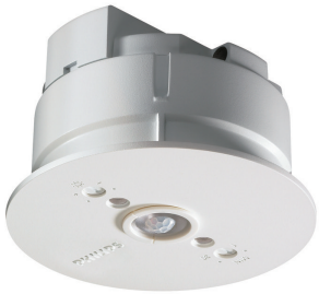
LRM1070/00 SENSR MOV DET ST