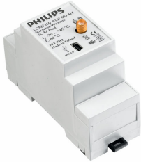
LCN7310/00 Starsense Wireless SC RF mod.